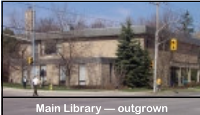
Main Library — outgrown

The City of Guelph needs a new Library Headquarters.