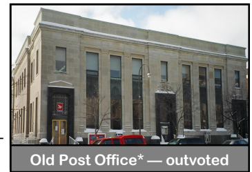
Old Post Office* — outvoted

The main library is the administrative hub of the Library system. It is the centre for ordering, receiving and processing of library materials, and the centre for the InterLibrary Loan system both among the branches and beyond. It is the administrative centre of the Library system including the bookmobile and the branches; the site of technology development and maintenance; and the site of the administrative and professional staff.