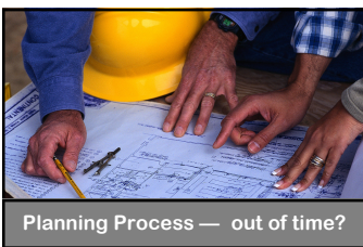
Planning Process — out of time?

Public libraries, by contrast, keep only current resources, even in their reference collections. Much of the library's collection is best sellers acquired in many multiple copies. Numbers of copies are reduced dramatically when the peak of interest has passed. Resources not used for a period of time are weeded completely from the collection. The mandate for retaining esoteric research information belongs to university libraries. Public libraries retain only information which needs to be readily available on the current shelves.